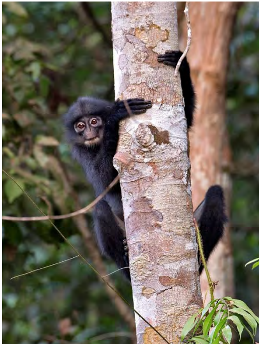
Figure 1. Raffles banded langur ( Presbytis femoralis femoralis ) in Johor.

The banded langur is found in the Malay Peninsula and Sumatra (Groves 2001) and three subspecies are currently recognised: Raffles' banded langur ( Presbytis f. femoralis ) in Johor and Pahang states, Malaysia and in Singapore (Fig. 1); East Sumatran banded langur ( P. f. percursa ) in eastern Sumatra; and Robinson's banded langur ( P. f. robinsoni ) in northwest Malay Peninsula, extending north throughout peninsular Thailand and Myanmar (Fig. 2).