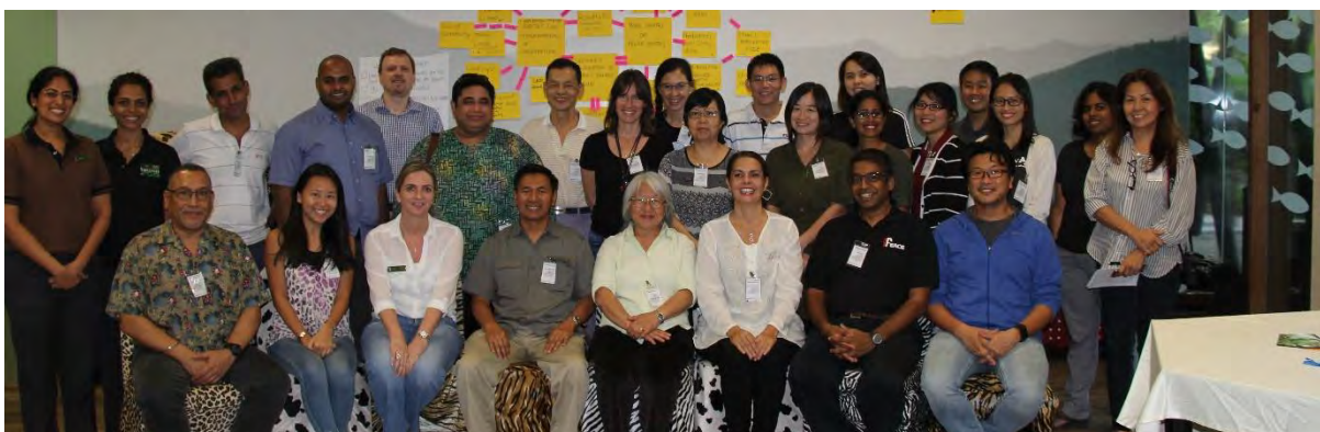
Figure 4. Participants at the strategy workshop held at the Singapore Zoo on 1-2 August 2016.

Finally, participants re-convened to finalise the Vision and Goals, to discuss next steps and to agree an editing team to oversee development of the report.