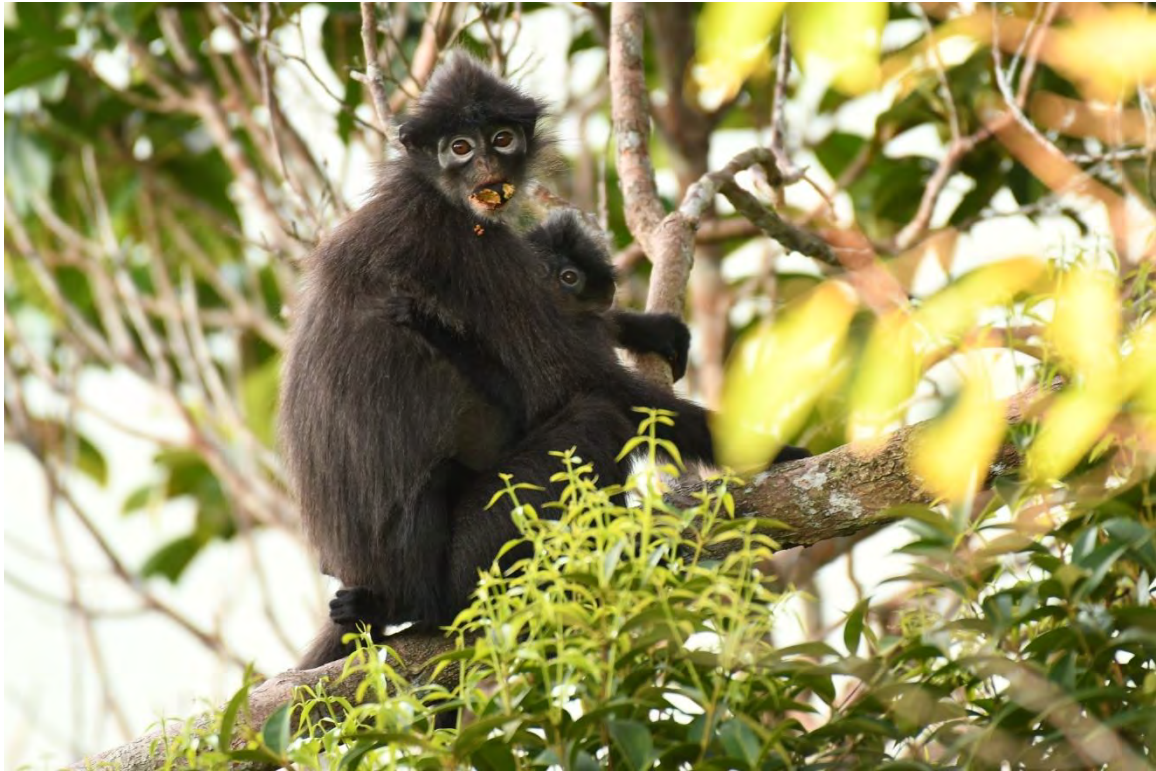
Figure 3. An adult Raffles' banded langur feeding on fruit.