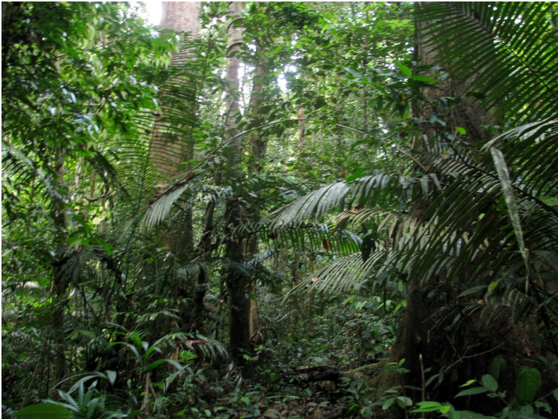
The forest interior of Malaysia's Taman Negara National Park. Tropical moist forests typically have complex vertical and horizontal structures, as well as diverse communities of plants and animals.

Deforestation in Southeast Asia is greater than previously recorded, according to authors of a recent analysis of satellite image data. The researchers highlight in particular the extensive but previously unrecorded conversion of higher-elevation forest to cropland. By combining multiple streams of high- and medium-resolution satellite imagery, the multinational research team calculated that Southeast Asia lost 82,000 square kilometers (31,700 square miles) of forest to croplands between 2000 and 2014.