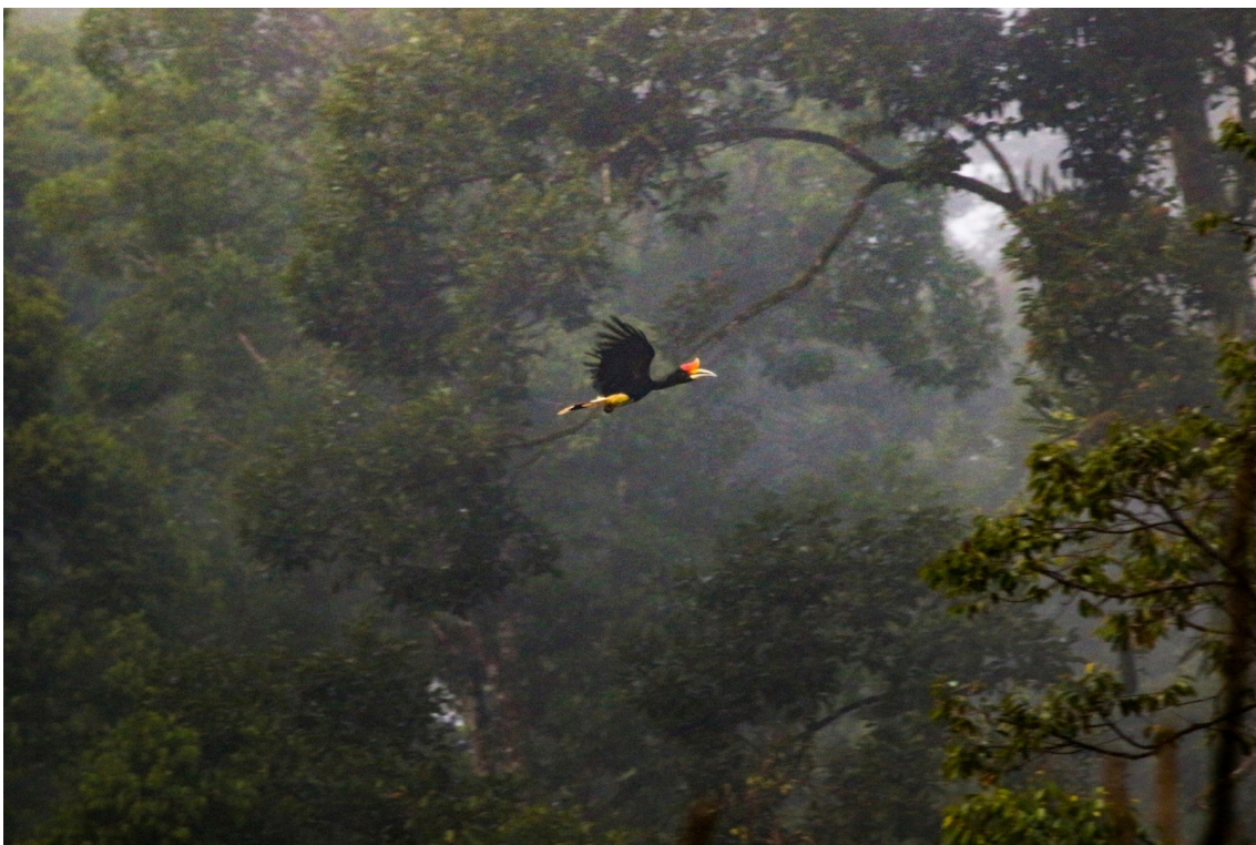
A rhinoceros hornbill flies through the forest canopy in Malaysian Borneo. These birds need extensive tracts of primary evergreen forest and nest in large trees.

But the current study raises questions about these assumptions, with its findings that forested areas are being converted for cropland at higher elevations as well as in known lowland regions.