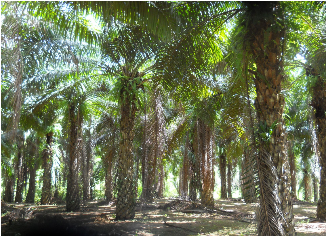
An oil palm plantation in Thailand. Landsat satellite data does not reliably distinguish forest from such mature tree crop plantations. However, plantations are monocultures that lack the complex structure and diversity of tropical forests.

The study's findings contrast substantially with projections of land-cover trends that decision-makers currently use to predict future climate change, terrestrial carbon storage, biomass, biodiversity, and land degradation. Moreover, although some crop trees contribute to maintaining carbon stock, they don't support the high biodiversity of complex tropical forest systems.