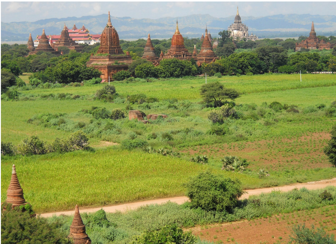
Forests in Bagan, Myanmar were converted to agriculture centuries ago.

For highland areas, this corresponds to roughly 82,000 square kilometers developed into croplands. A "substantial portion" of this reflects clearing of mature forests. Forests cleared for growing crops occurred mainly in the higher elevations in mainland Southeast Asia and primarily in the lowlands in maritime areas, corresponding roughly to Malaysia and Indonesia.