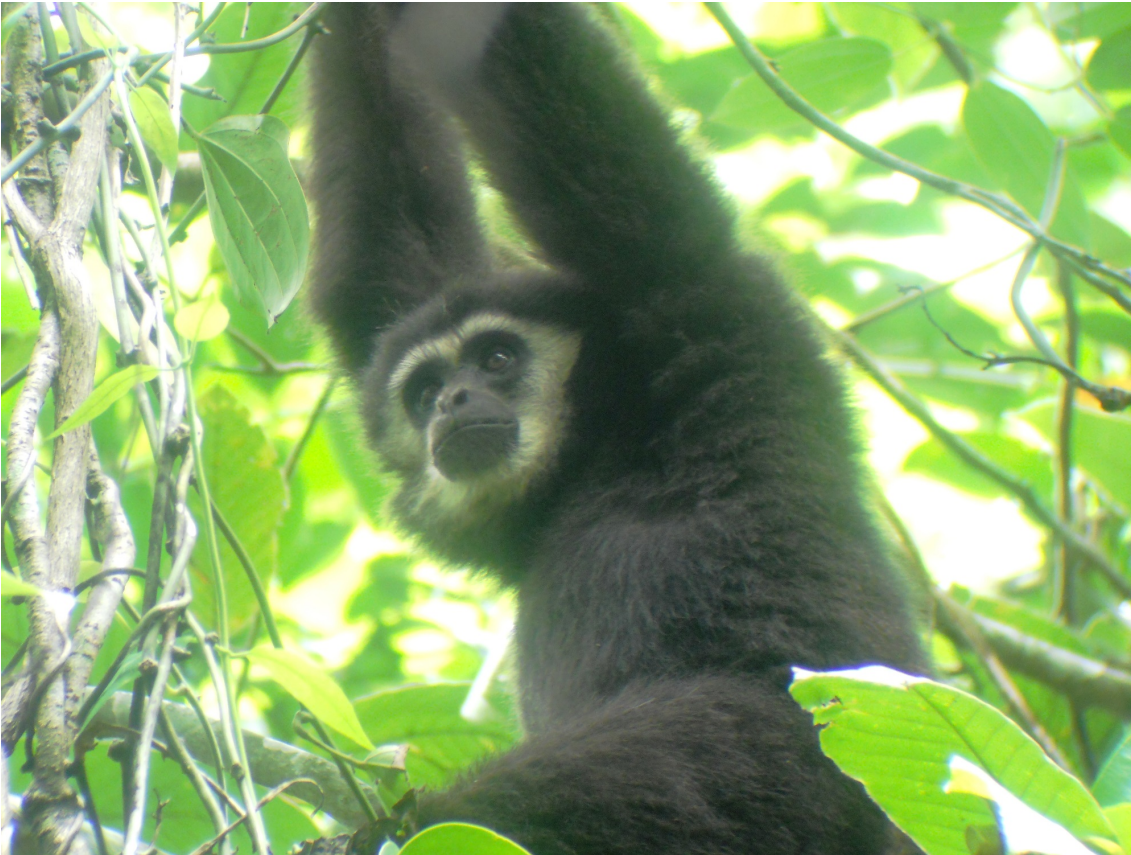
A white-handed gibbon in Thailand's Khao Yai National Park, like gibbons across Southeast Asia, depends on its upland forest for its survival.

Once they determined the spatial patterns of cropland expansion since 2000, they compared their deforestation patterns to other land-cover datasets, including the global land-cover reconstructions used in Intergovernmental Panel on Climate Change (IPCC ( http://www.ipcc.ch/ )) climate simulations.