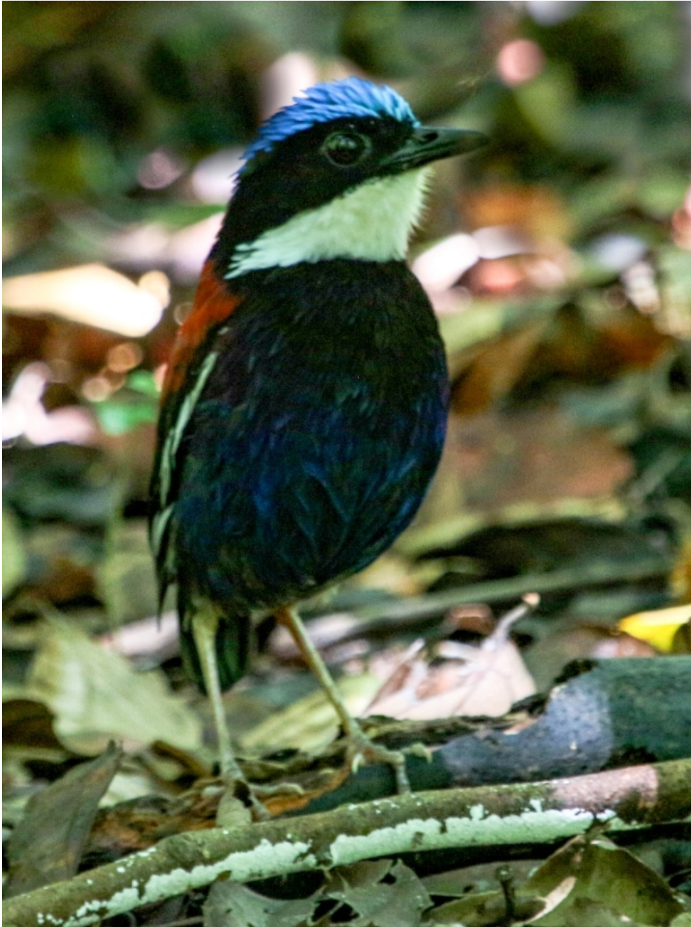
Forest birds such as the blue-headed pitta from Malaysia's Kinabatangan River region are threatened by logging and conversion of tropical forest to agriculture, including tree crops.

The findings raise uncertainty about several assumptions used to make global climate change projections, and suggest the impacts of forest clearing may be greater than previous predictions. Forests absorb atmospheric carbon, and burning forests contribute carbon to the atmosphere. IPCC estimates are widely used for creating policy and setting benchmarks of carbon emission reductions. An accurate estimation of forest cover is therefore critical in assessing the impacts of human activity on climate change.