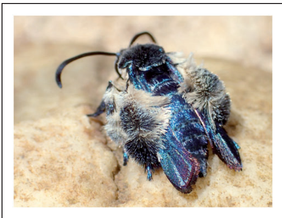
Figure 3. In sunlight, Heterosphecia tawonoides has a strong blue sheen on wings, abdomen, and tarsomeres.

Abdomen: Black with strong blue sheen, smooth-scaled with several short white hair-like scales, bigger and