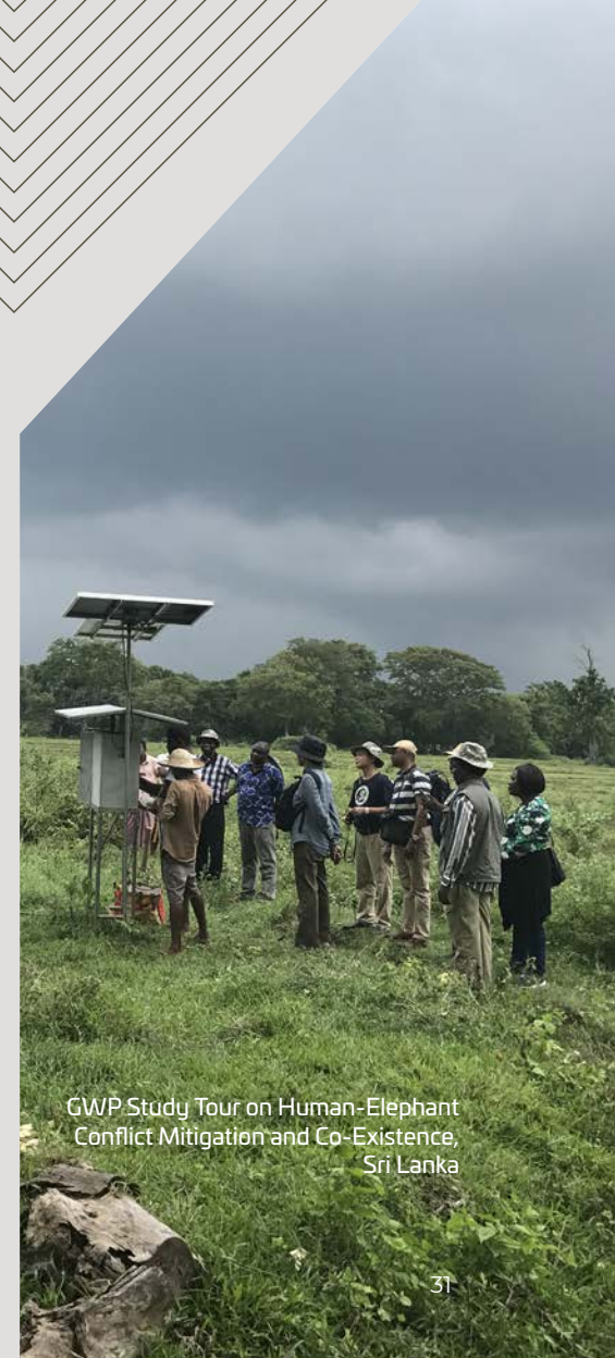
GWP Study Tour on Human-Elephant Conflict Mitigation and Co-Existence, Sri Lanka

Knowledge sharing and management is a core component of the GWP. Projects share lessons learned, generate best practices, and exchange information in support of conservation and sustainable development. The GWP knowledge platform includes webinars, in-person knowledge exchange events, training sessions, and coordination mechanisms. Communications and knowledge products such as publications, e-books, feature stories, and videos are all available on the GWP website.