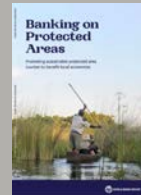
Banking on Protected Areas: Promoting Sustainable Protected Area Tourism to Benefit Local Economies