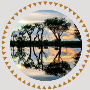
Conserving Wildlife & Habitats