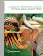
Analysis of International Funding to Tackle Illegal Wildlife Trade