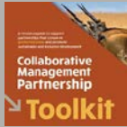
Collaborative Management Partnerships Toolkit