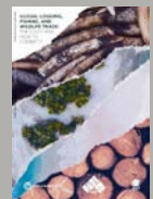
Illegal Logging, Fishing, and Wildlife Trade: The Costs and How to Combat It