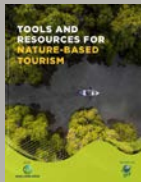
Tools and Resources for Nature-Based Tourism and e-book