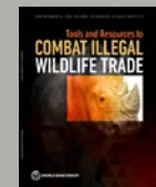
Tools and Resources to Combat Illegal Wildlife Trade