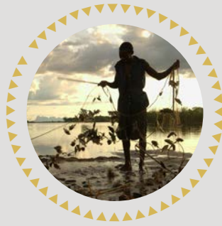
Promoting Wildlife-Based Economies