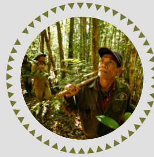
Combating Wildlife Crime