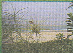
Female flowers of Spinifex littoreus on a sandy beach at Gebeng, Pahang