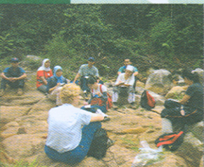
Briefing at Kenyir

The new Flora will cover 8,300 species of lycophytes (selaginellas and lycodiums), ferns, gymnosperms and flowering plants, both indigenous and naturalised, and provide detailed descriptions, critically cite pertinent literature and types, deal with nomenclatural problems, provide keys for identification and shall be well illustrated by botanical drawings and colour photographs.