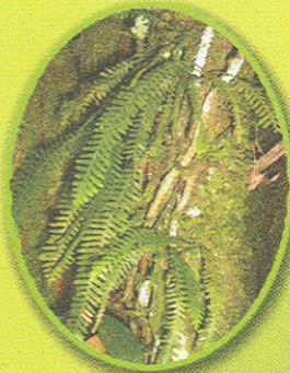
Prosaptia obliquata , usually epiphytic on trees and only once recorded from rocks in a stream.