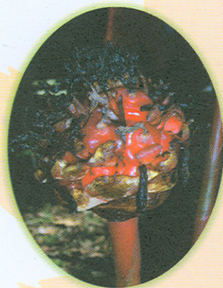
Fructing head of Etlingera maingayi , widespread in Peninsular Malaysia.