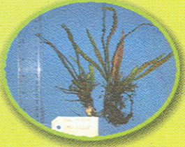
Grammitis reinwardtii collected from the upper montane forest of Gunung Ulu Kali.