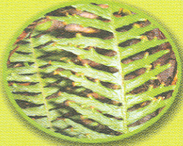
Prosaptia contigua —in Peninsular Malaysia, only known to occur from Perak, Pahang, Terengganu and Selangor.