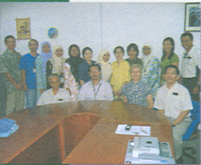
Participants and instructors of the first Flora Writing Course