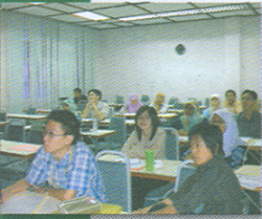
Engrossed participants at the Lycophte and Fern Workshop, 17 August 2006