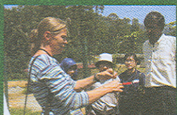
Learning about grass