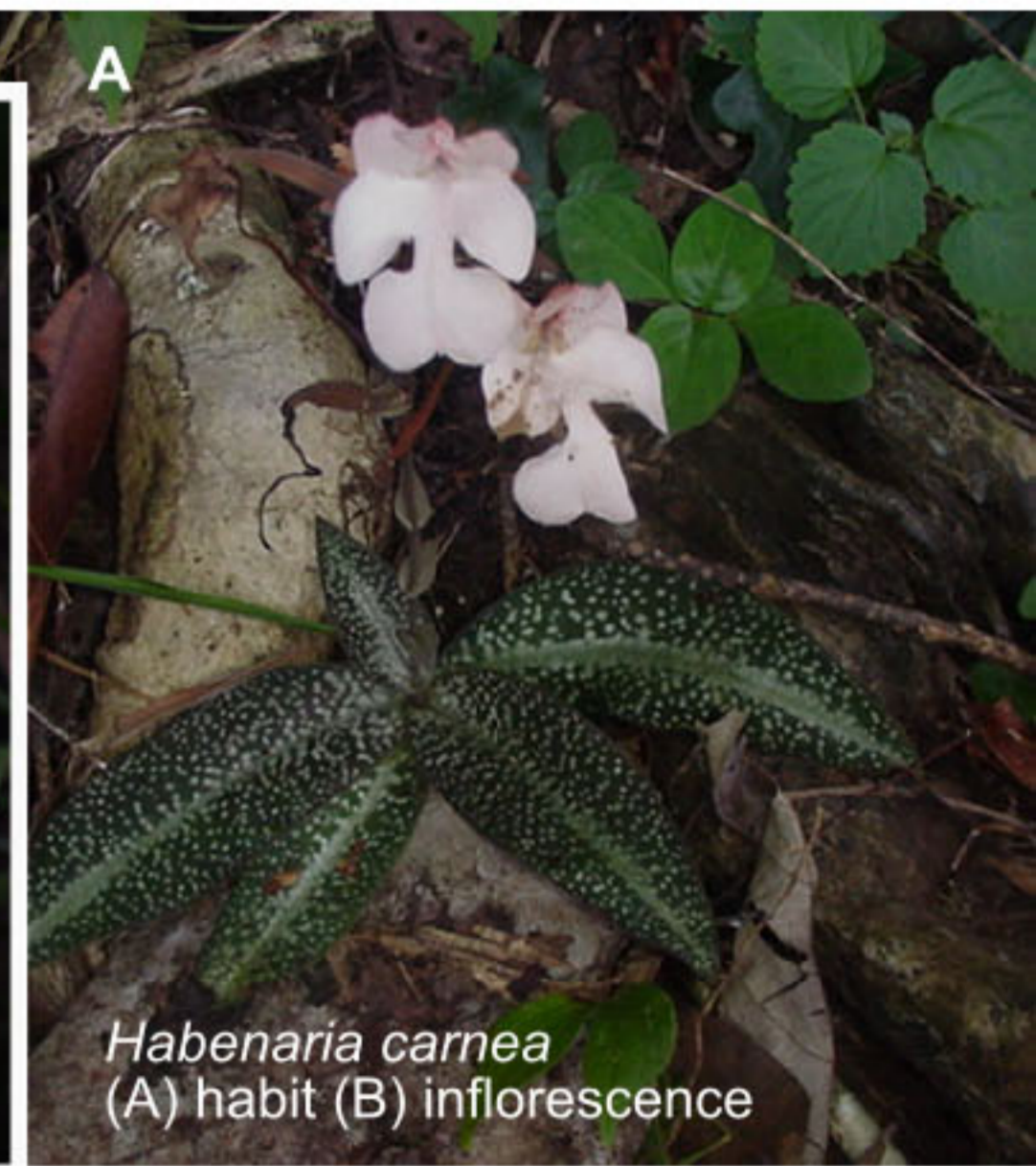
Habenaria carnea (A) habit (B) inflorescence

Habenaria carnea is another interesting limestone orchid. Its leaves appear in two colour forms. The juvenile plants have brown leaves with white dots; when they reach reproductive maturity, the colour gradually changes from brown to olive green. In full bloom, the leaves are entirely green, speckled with white dots (Yong 2006). This species has beautiful pink flowers arranged in a terminal inflorescence. Its median sepal is fused with petals thus forming a hood.