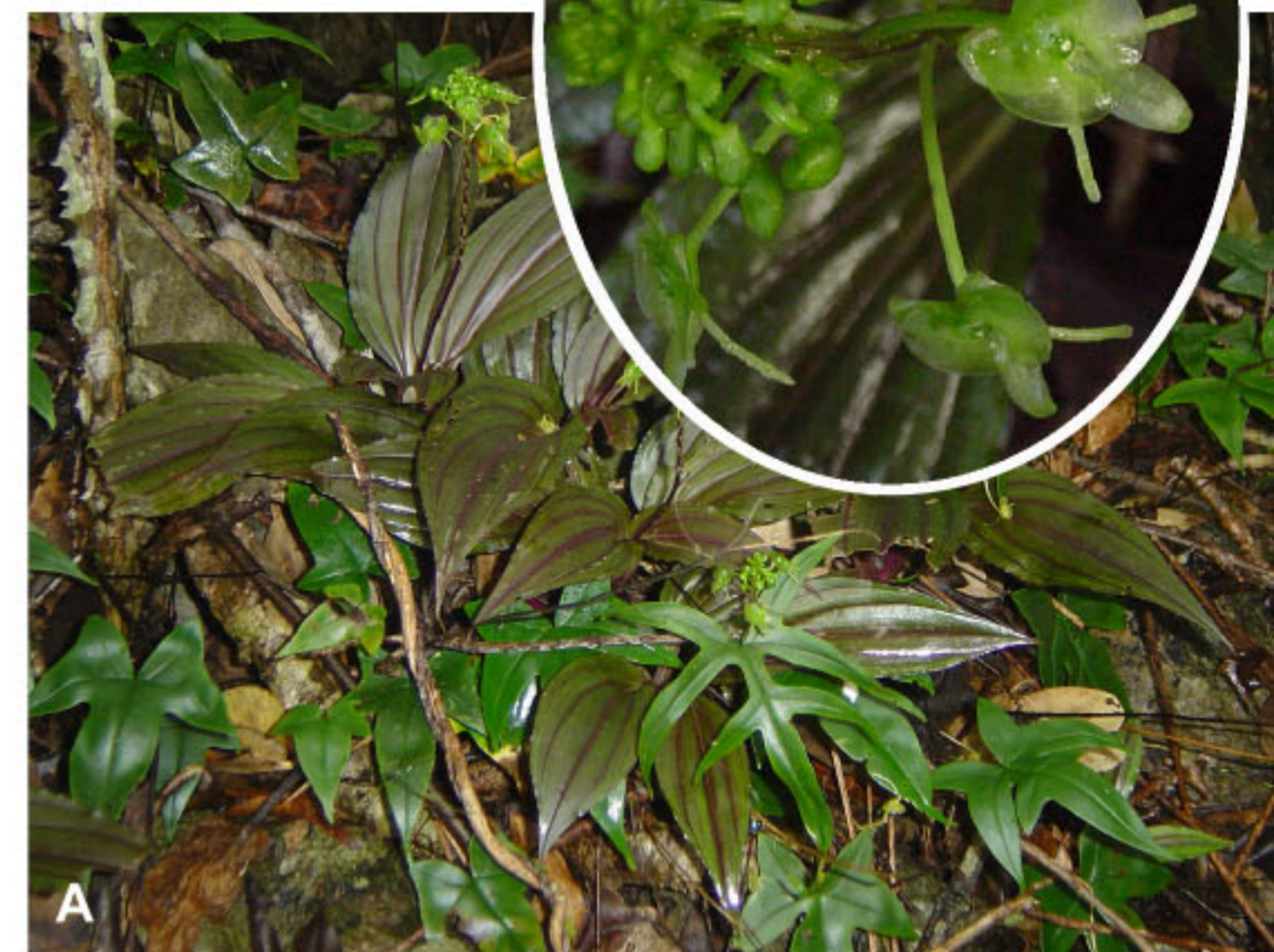
Malaxis prasina (A) growing among the ferns (B) flowers

Habenaria carnea is another interesting limestone orchid. Its leaves appear in two colour forms. The juvenile plants have brown leaves with white dots; when they reach reproductive maturity, the colour gradually changes from brown to olive green. In full bloom, the leaves are entirely green, speckled with white dots (Yong 2006). This species has beautiful pink flowers arranged in a terminal inflorescence. Its median sepal is fused with petals thus forming a hood.