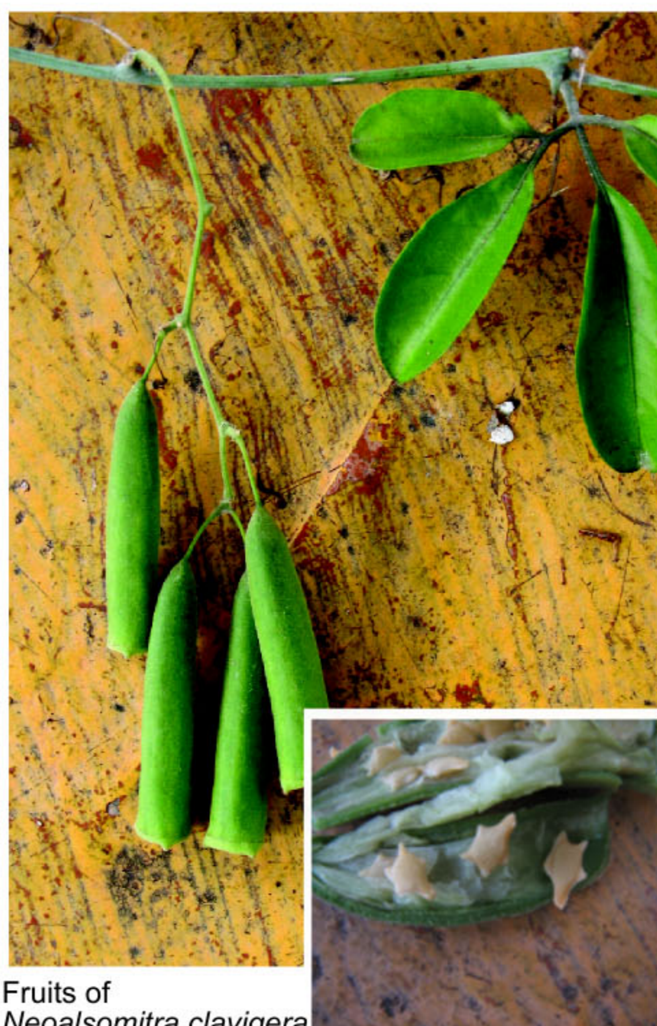
Fruits of Neosalsmitra clavigera

rare in Peninsular Malaysia, Neosalsmitra clavigera is widely distributed from southeast Continental Asia including south China through east Malesia to Australia and the Pacific in seasonally dry forests. The species is absent from tropical everwet rain forests.