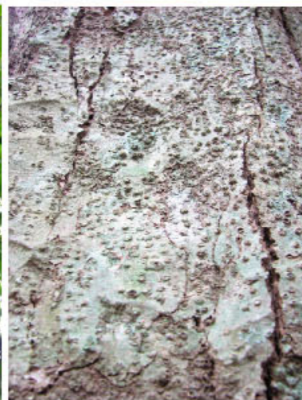
Scaly, lenticellate bole