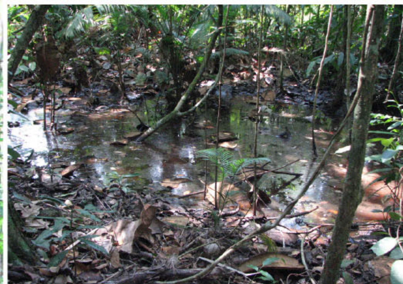
Fresh water swamp forest. The forest floor is water-logged and dense with tree saplings