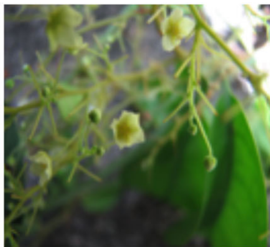
Flowers of Neosalsmitra clavigera

Neosalsmitra clavigera is the only species of its genus found in Peninsular Malaysia and locally, was previously known only from Pulau Langkawi and mainland Kedah. This is a new record for Perlis. Although