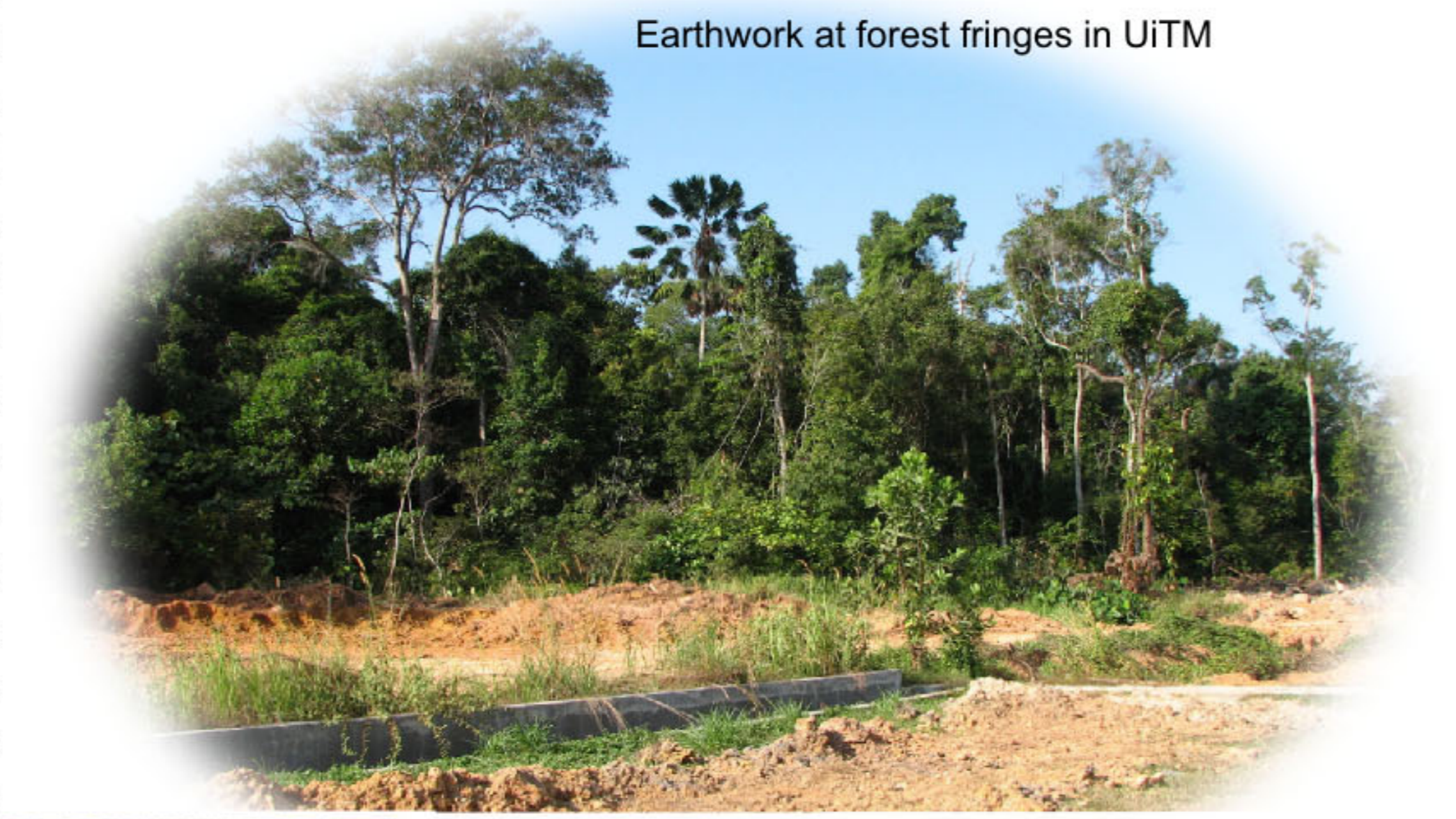
Earthwork at forest fringes in UiTM

This example is one of the most recent on how research helps in refining development policies that have impact on biodiversity and the environment. It demonstrates that there is a workable balance between development and conservation. Dipterocarpus semivestitus is an excellent example because conservation of the population is complicated by the fact that the land no longer belongs to the State Government and that there are pressures within the University to develop the area. The road to effective conservation is long and arduous, in this case requiring much negotiation between stakeholders. Contributions from all stakeholders are crucial to the effective conservation of species and populations.